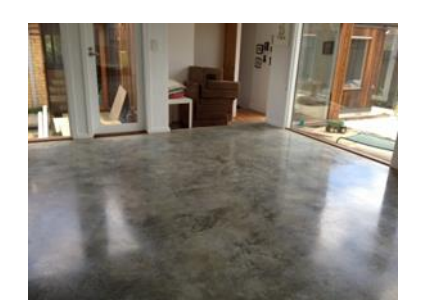
Burnishing is used for maintenance, rejuvenating and removing mechanical or chemical damage.